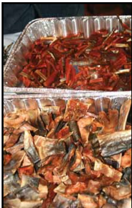
Figure 6. Dry salmon and salmon strips contributed to a community potluck.

The decrease in size of salmon is important to note in terms of overall subsistence harvest. While some individuals in some communities may be catching approximately the same amount of fish as they did 10 or 20 years ago, those fish were much larger and had more meat overall (i.e. the total body weights of 20 fish today and 20 fish 30 years ago are not equal). And if you are catching smaller numbers of fish, the decreased size of the salmon even further decreases the overall amount available for consumption.