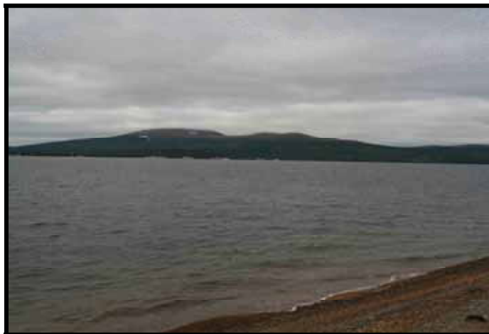
Figure 5. Weather system at Golovin, Bering Strait region, 2009.

Golovin interviewees have also noticed changes in the wind, including strength and duration, though one interviewee said that he has not noticed any changes. One couple has seen an increase in “whirlwinds” in the area (it is not clear if these were ‘waterspouts’ over open water or ‘dust devils’ over dry land).