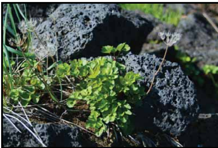
Figure 4. Tukkaayuk (sea lovage, ligusticum scoticum) greens collected by region residents for subsistence.

Melting permafrost and ice lenses, which several interviewees have seen, are posited as possible reasons for some of the erosion, as are storms and wind, and ice movement during breakup (see Changes in Weather section, below). One interviewee has noted an increase in deposition in front of one part of the village where the beach has raised in height by “a couple feet.”