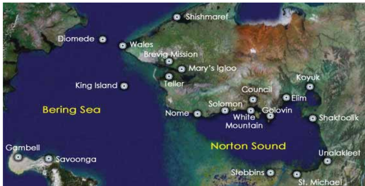
Figure 2. Map of the Bering Strait region, showing the three communities that participated in this study (Brevig Mission, Golovin, Unalakleet).

appropriate for presentation in a ‘timeline’ format. The temporal data collected will be summarized, along with the other data collected, in the “results” section, below.