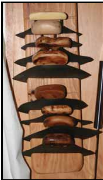
Figure 3. A variety of ulu knives used for processing subsistence foods, like salmon.

Unalakleet is located approximately 147 miles southeasterly of Nome at the mouth of the Unalakleet River in Norton Sound. It has no road access to Nome and must receive all of its goods by air or barge in the summer, and is a sub-regional hub with more air access options than other villages. The 2000 US Census indicates Unalakleet has a total population of 747, of those 399 are male and 348 are female. Six hundred thirty seven of the total population is American Indian or Alaska Native. The most recent subsistence salmon harvest data for Unalakleet (Ahmasuk et al. 2008) indicates that the community harvested approximately 2,343 Chinook salmon in 2006.