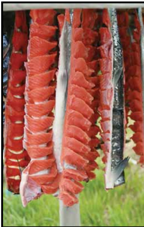
Figure 1. Salmon drying on a fish rack in Norton Sound.