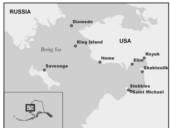
Fig. 1. Study area, showing participating communities.

Nine of twenty Bering Strait and Norton Sound region federally recognized tribes participated in this project: Nome, King Island, Diomede, Savoonga, Elim, Koyuk, Shaktoolik, Stebbins, and Saint Michael.