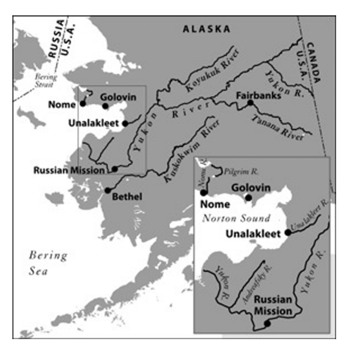
Fig. 1. Study area.

fisheries management accompanied by recommendations for this integration (Figs. 1 and 2).