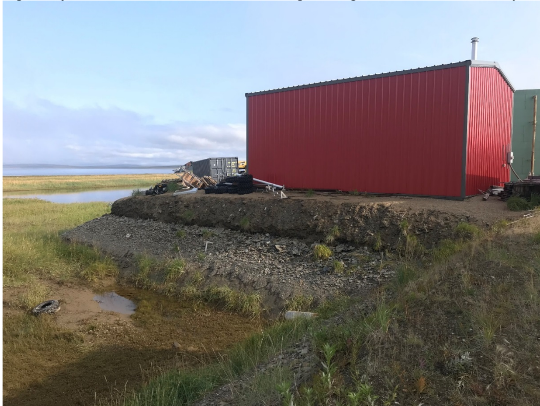
Golovin, AK, August 2019 – the flood protection berm surrounding the power plant and other community facility structures has greatly eroded in the past few months.

Besides stronger infrastructure, micro grid systems in remote villages should incorporate innovative, renewable energy systems to reduce their own diesel emissions and decrease dependency on fossil fuels. Villages are doing their best to conserve energy, make power efficiently, and commit to keeping their energy clean – we understand we can only improve regionally, and statewide if we strive for the greatest possible health and safety.