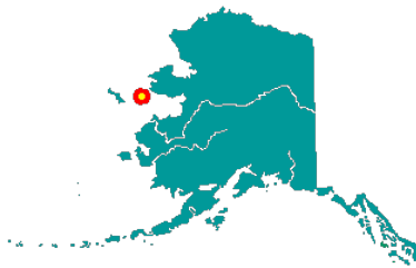
King Island's location in Northwestern Alaska