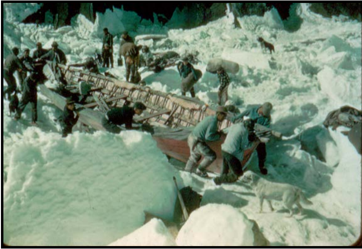
King Island men working together to launch a skin boat.

Participants then made recommendations in applying the community values in King Island's economic development plan. This provided methods to apply the values and guide the implementation of the vision and development goals.