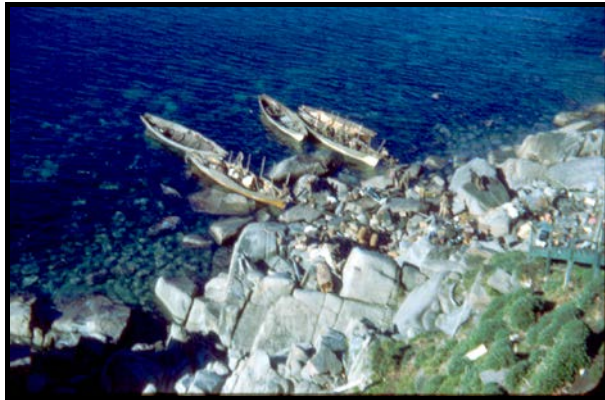
An old picture of skin boats in the water at King Island.