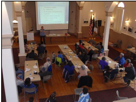
King Island Community Annual Meeting