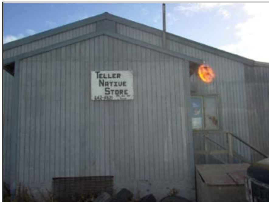
Teller Native Store