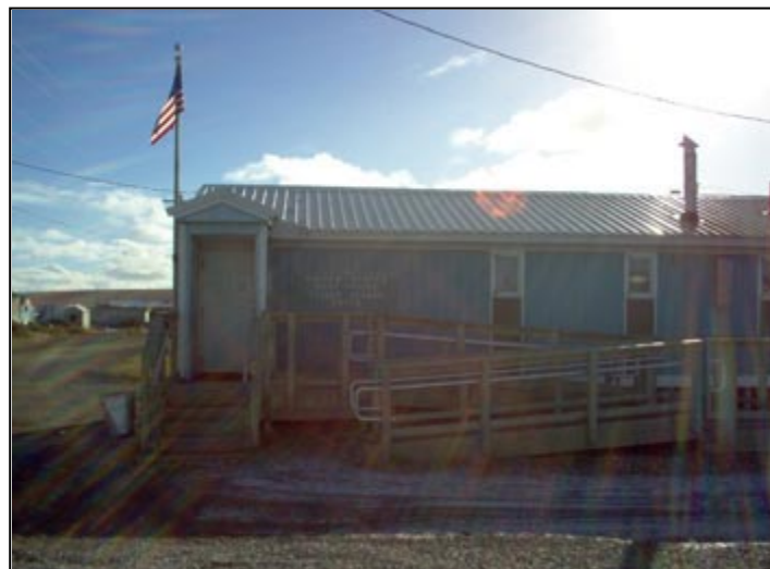
Teller Post Office

Teller is serviced by different barging companies during the ice-free summer months. Barges cannot currently land at Teller because there is no dock. Supplies are lightered from Nome and offloaded on the beach. The community is interested in the construction of a docking facility for barges. Port Clarence is a natural harbor and has been considered for a deep water port.