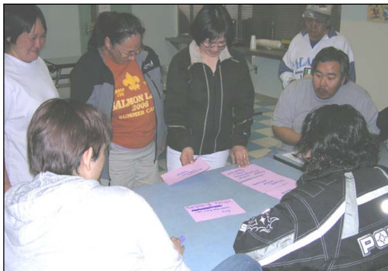
Prioritizing projects for the next five years.