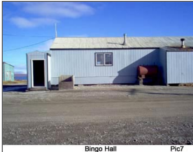
Bingo Hall Pic7

approximately 980,000 watts that can be received well over 1000 miles from its origin. It is an electronic system, which propagates low frequency radio waves from a fixed radio transmitter to mobile receivers to allow travelers to determine their position. LORAN operates twenty-four hours a day in all weather extremes. Logistic supplies are received every three weeks via C-130 aircraft from Air Station Kodiak. Mail is received three days a week by commuter plane from Nome, AK. Heating and operating fuel arrive in the summer by barge once a year. Unfortunately, the installation of the radar affected the migration of the Beluga whale, which are very sensitive to the radar. They stopped coming into the inlet or passing close to the shore which has affected subsistence hunting. When some buildings were dismantled in the 1970's at Port Clarence, the wood was brought to Brevig Mission and Teller to be recycled and used to build houses. However, it was too late in the year to get proper insulation and many of those homes were hastily built using grass or moss as insulation. Villagers often times travel to Port Clarence to sell arts and crafts to the personnel that are stationed there.