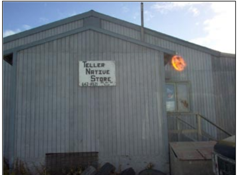
Teller Native Store

The records below reflect current business licenses on file with the Department of Community and Economic Development, Division of Occupational Licensing, Business Licensing Section. These licenses may not represent actual business activity.