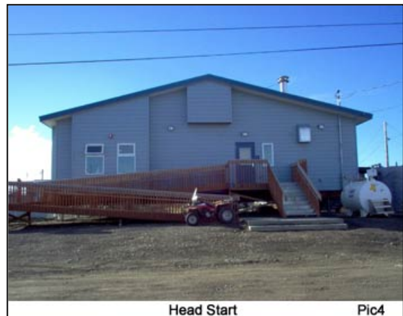
Head Start Pic4 Kaverak Head Start Building