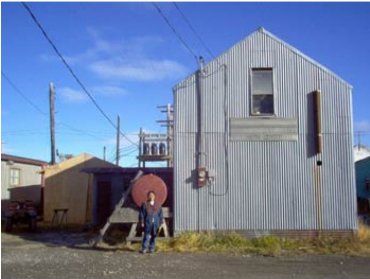
Native Village of Mary's Igloo Building is shared with Mary's Igloo Native Corporation