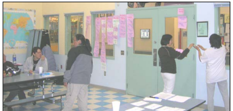
Categorizing project ideas into groups.