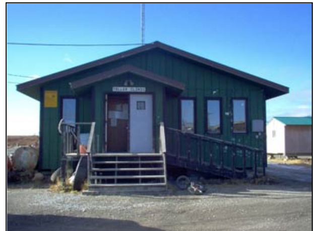
Old Teller Clinic

The local health aides are long-term employees with excellent training and experience. A public health nurse comes to do administer vaccinations annually. A medical doctor and a physical therapist come bi-annually to Teller to see patients. Physician's assistants come every two months. Eye doctors, dentists, and audiologists come annually. The Village-based counselor is a long-term employee. It is estimated that 7-10 residents must go to Nome for treatment each month and 1-2 go to Anchorage for treatment each month.