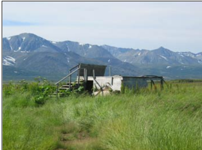
Hot tub at Pilgrim Hot Springs

The people of the Native Village of Mary's Igloo live in Teller, Alaska. The village of Mary's Igloo was originally called "Kauwerak" and is located on the northwest bank of the Kuzitrin River, on the Seward Peninsula, northeast of Nome, 40 miles southeast of Teller. It lies at approximately 65.141898°