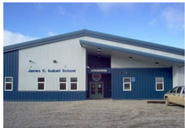
James C Isabell School

In 2010 there were 65 students and 9 teachers in the K-12 schools in Teller. In 2010 the Kawerak Head Start program had 1 teacher and 14 preschool students.