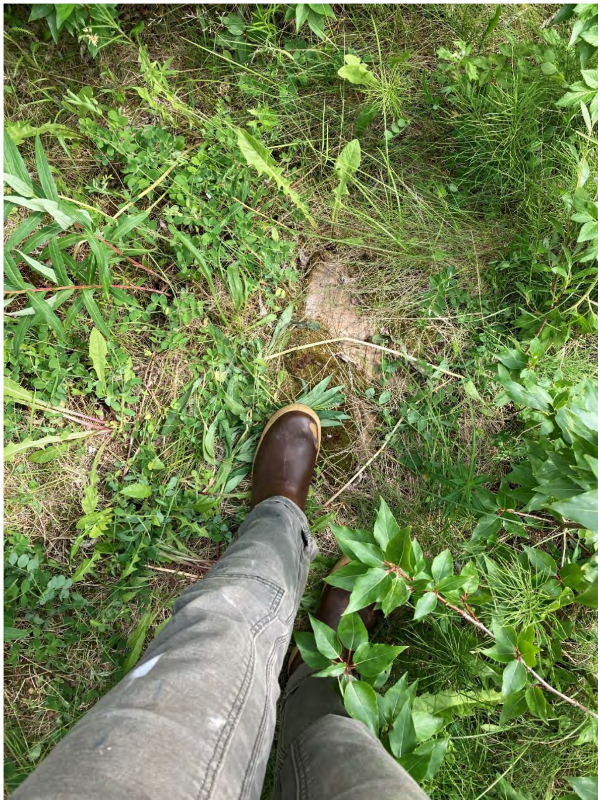
0718ELM29 – Debris by drum area northeast of the tankfarm