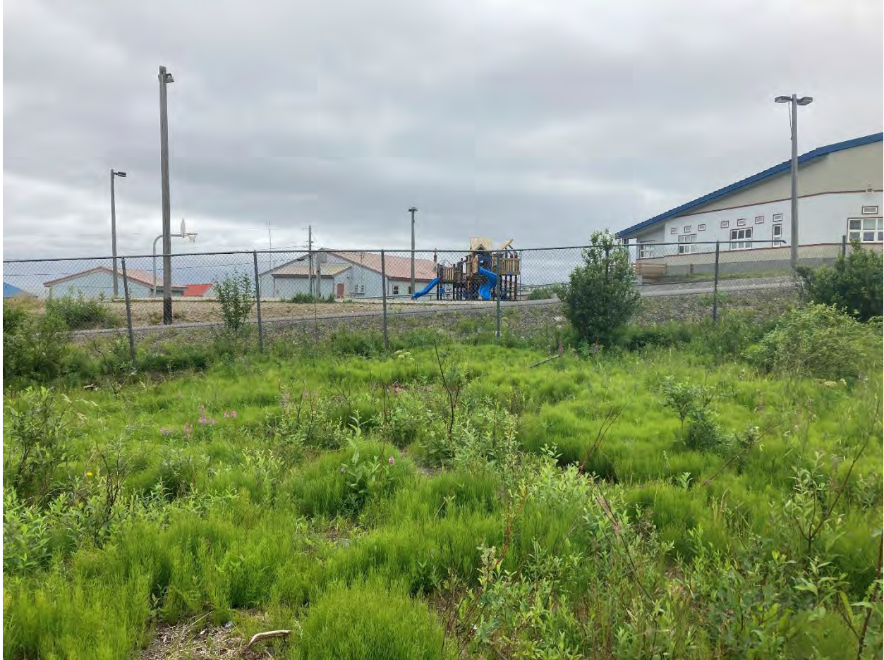
0718ELM08 – Facing southeast