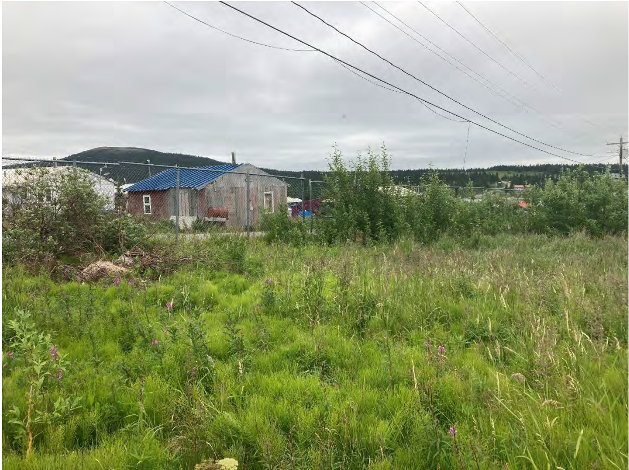
0718ELM05 – Facing north