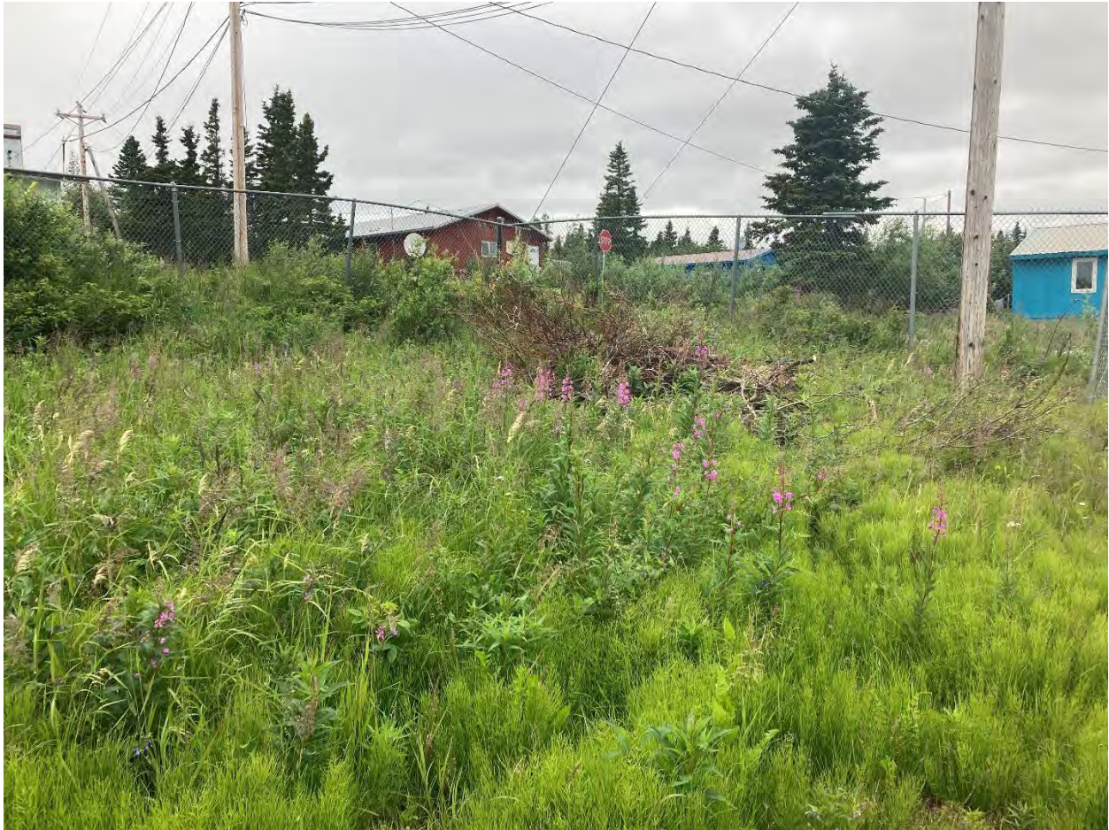
0718ELM03 – Facing west