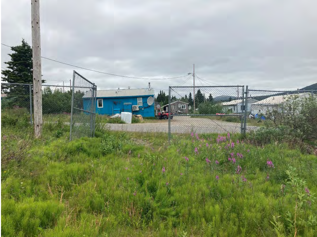
0718ELM04 – Facing northwest