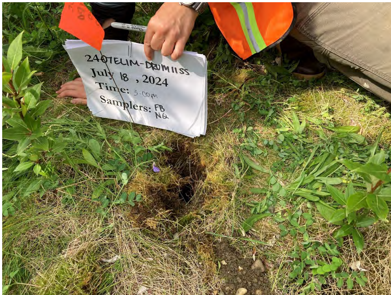
0718ELM27 – 2407ELIM-DRUM11SS