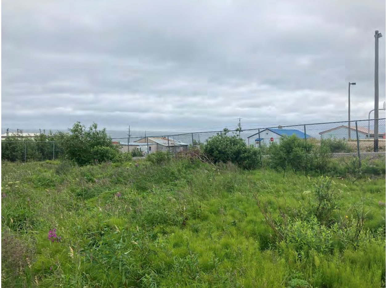
0718ELM07 – Facing east