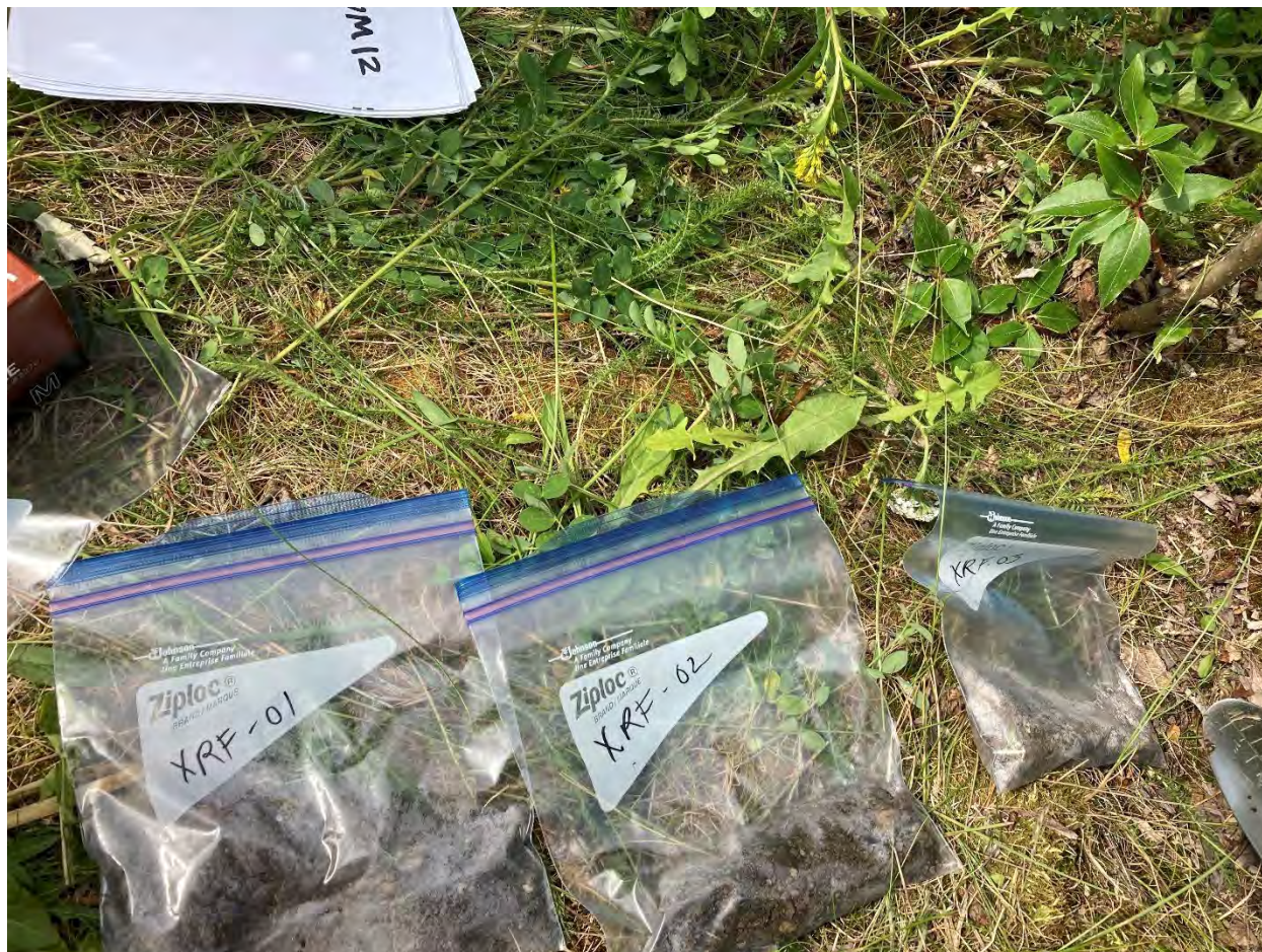
0718ELM31 – XRF screening samples