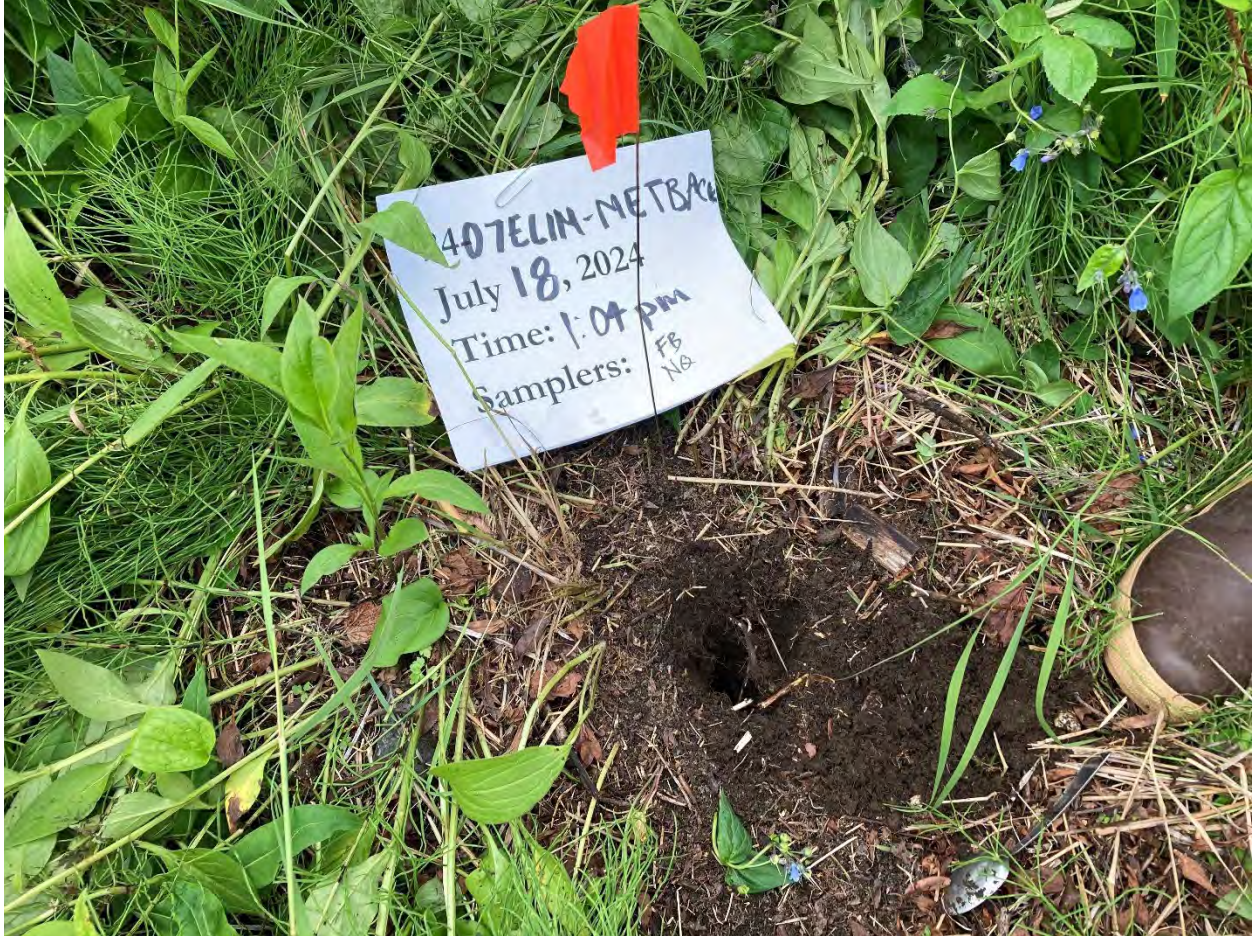
0718ELM15 – 2407ELIMMETBACK