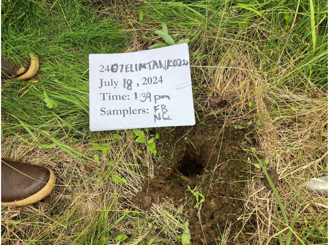
0718ELM19 – 2407ELIM-TANK02SS