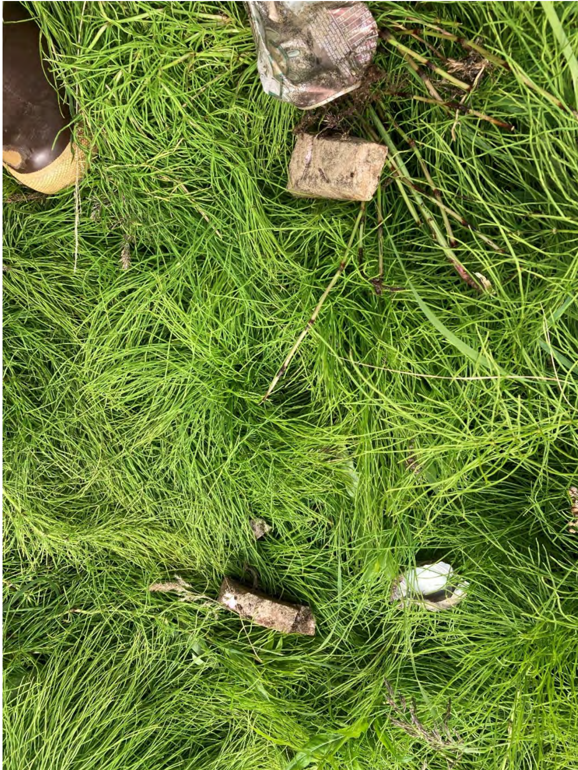
0718ELM37 – Buried foam and soda cans found at 2407ELIM-TANK06