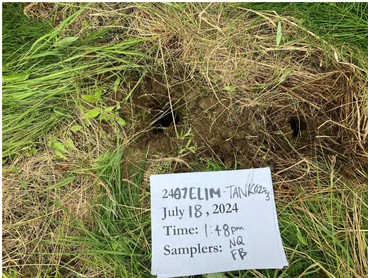
0718ELM20 – 2407ELIM-TANK02SUB