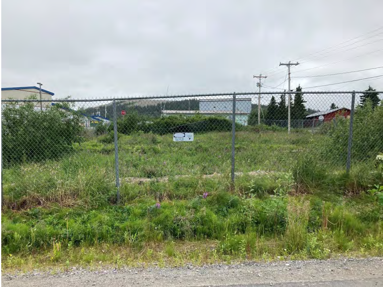
0718ELM11 – View from outside of site, facing southwest.