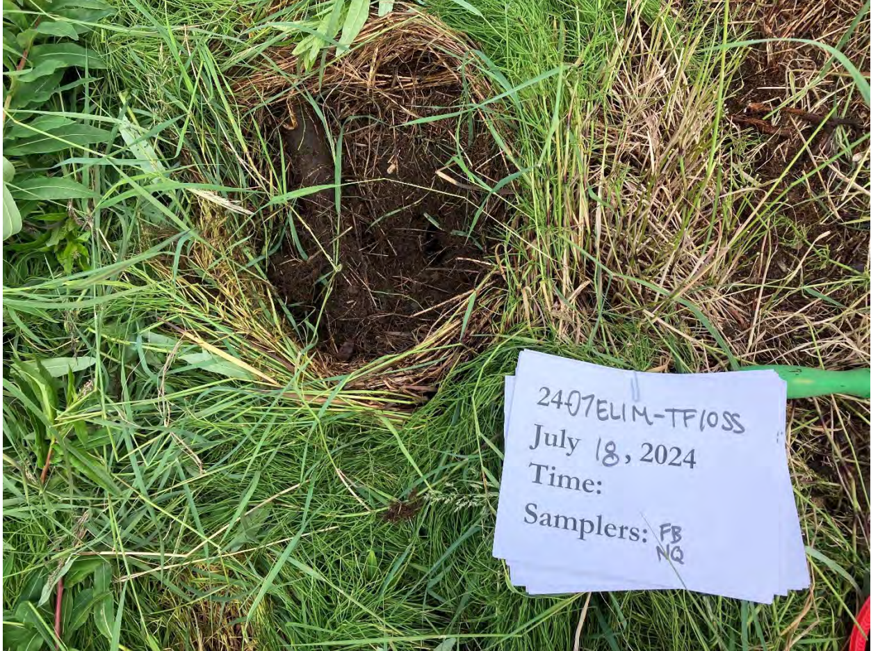
0718ELM24 – 2407ELIM-TF10SS, time: 2:30pm