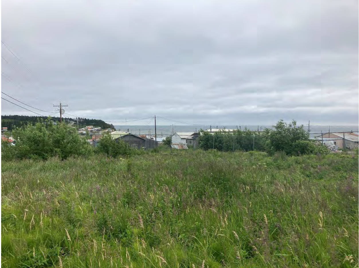
0718ELM06 – Facing northeast