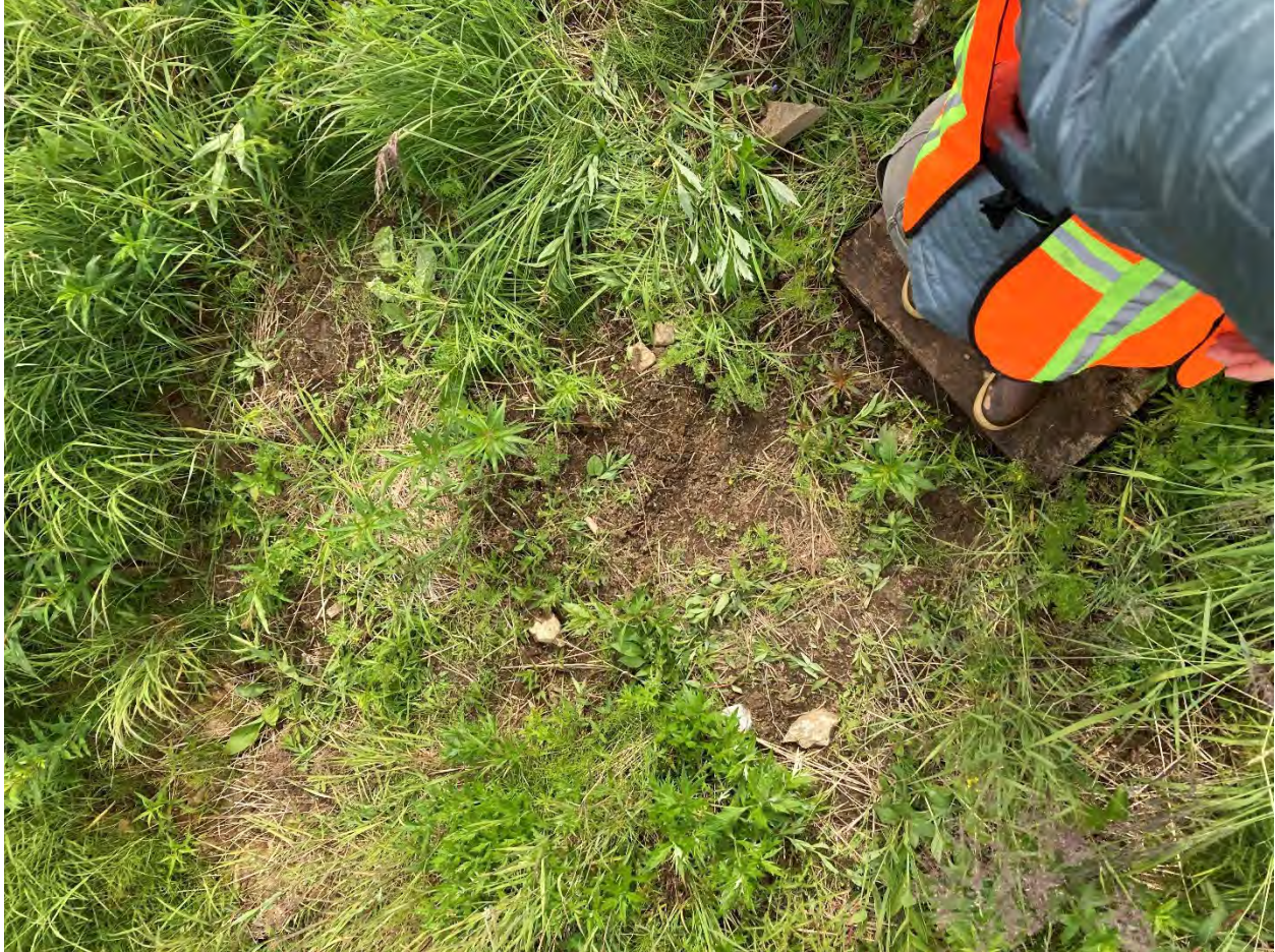
0718ELM34 – Area of stained soil