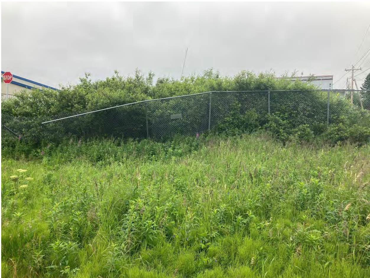
0718ELM02 – Facing southwest