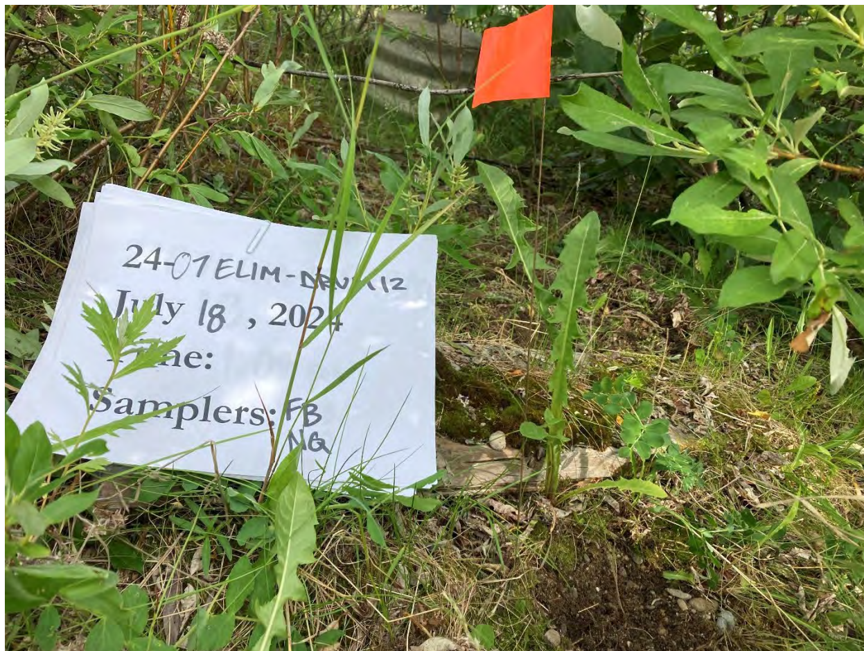
0718ELM32 – 2407ELIM-DRUM12, time: 3:20pm