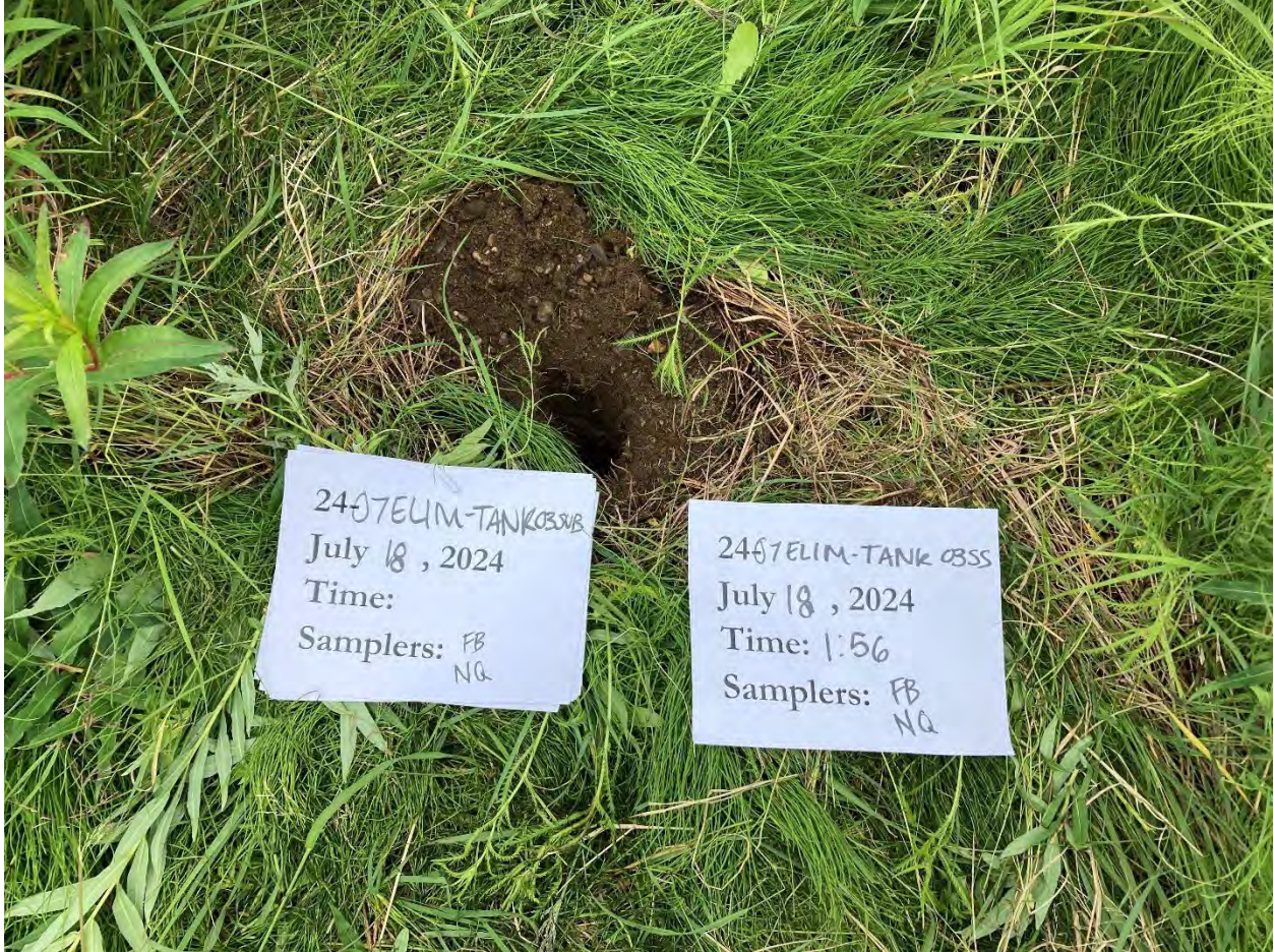
0718ELM21 – 2047ELIM-TANK03SUB and 2407ELIM-TANK03SS