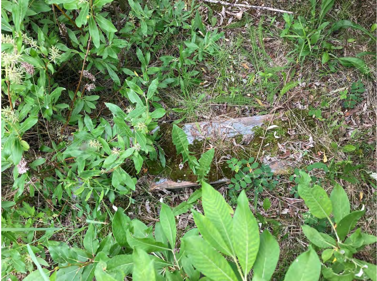
0718ELM10 – wood debris with potential lead paint chips outside of tank farm footprint, on northern area of site