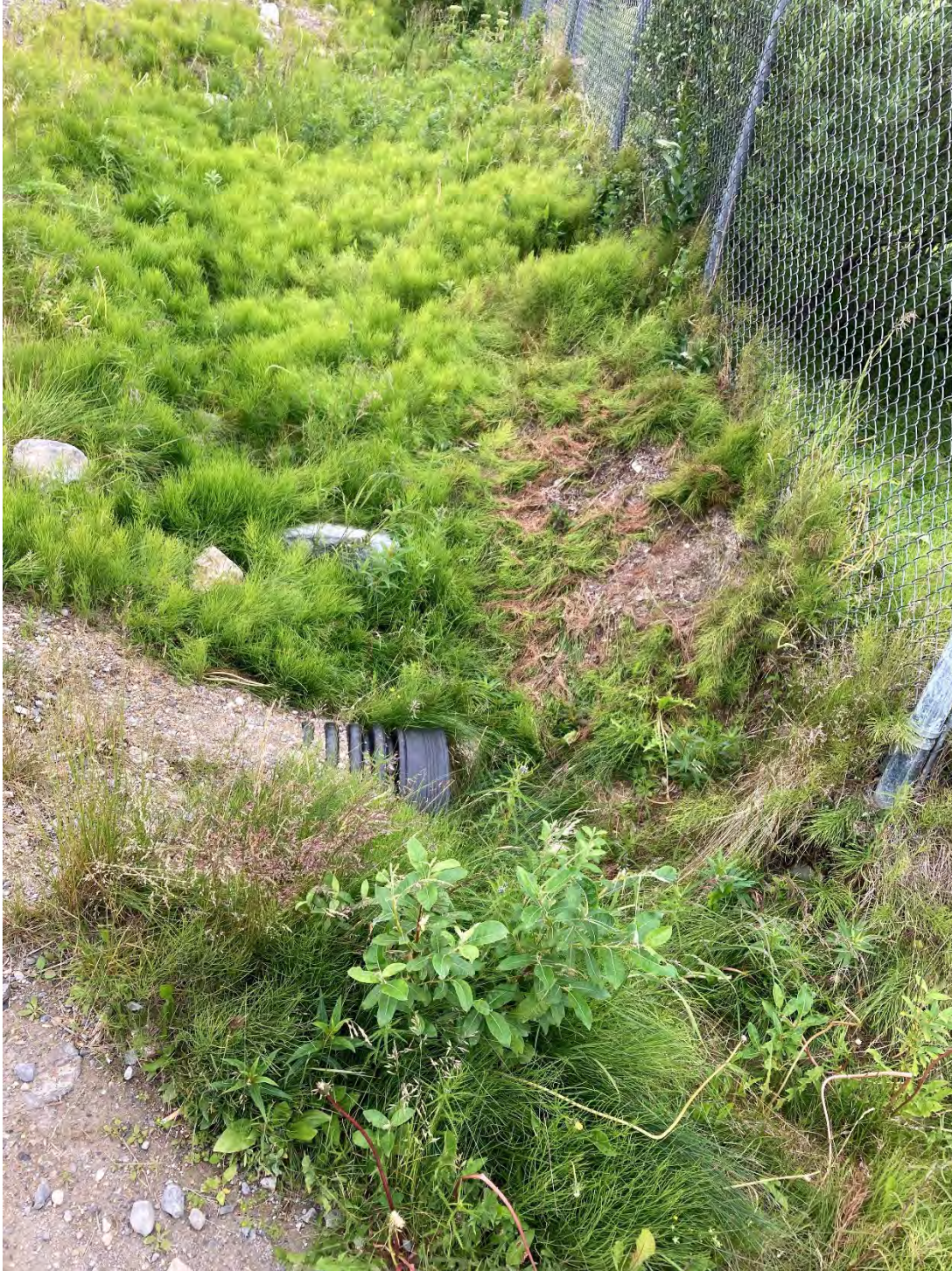
0718ELM12 – Suspected drainage pipe outside of site boundaries, at eastern corner of site