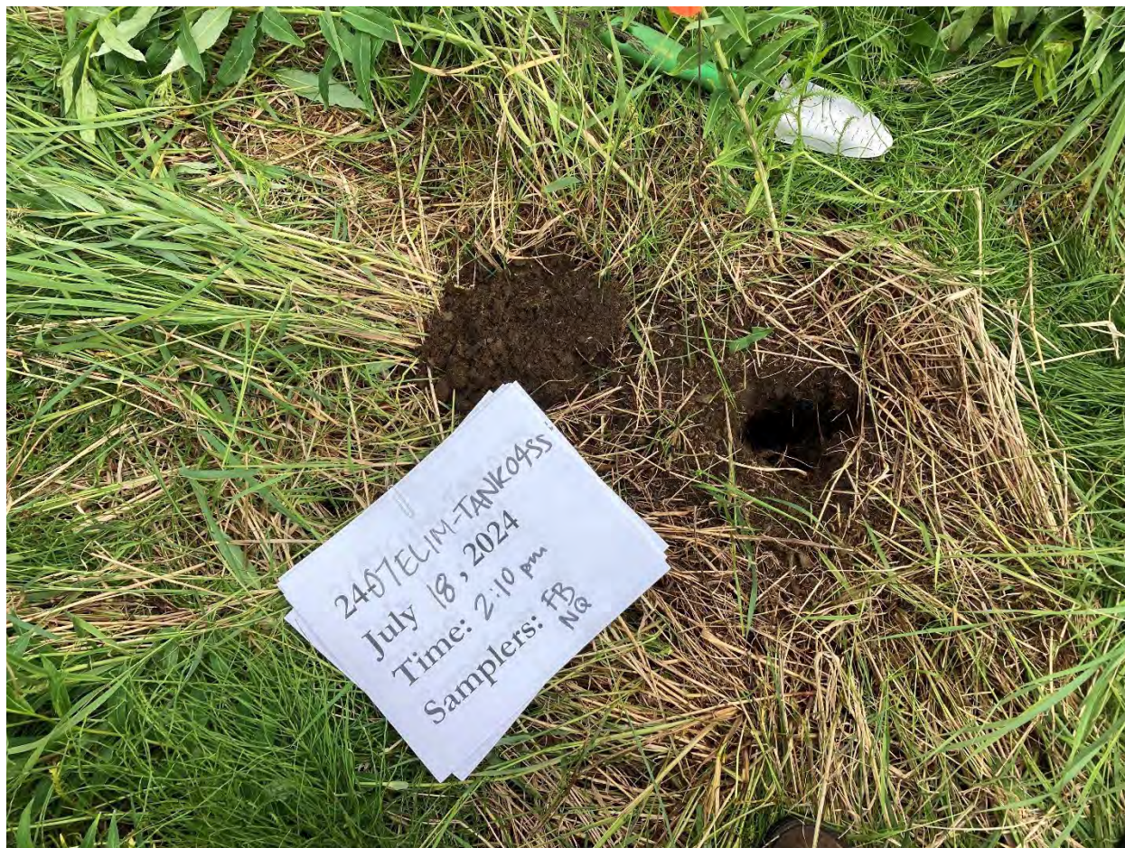
0718ELM22 – 2047ELIM-TANK04SS