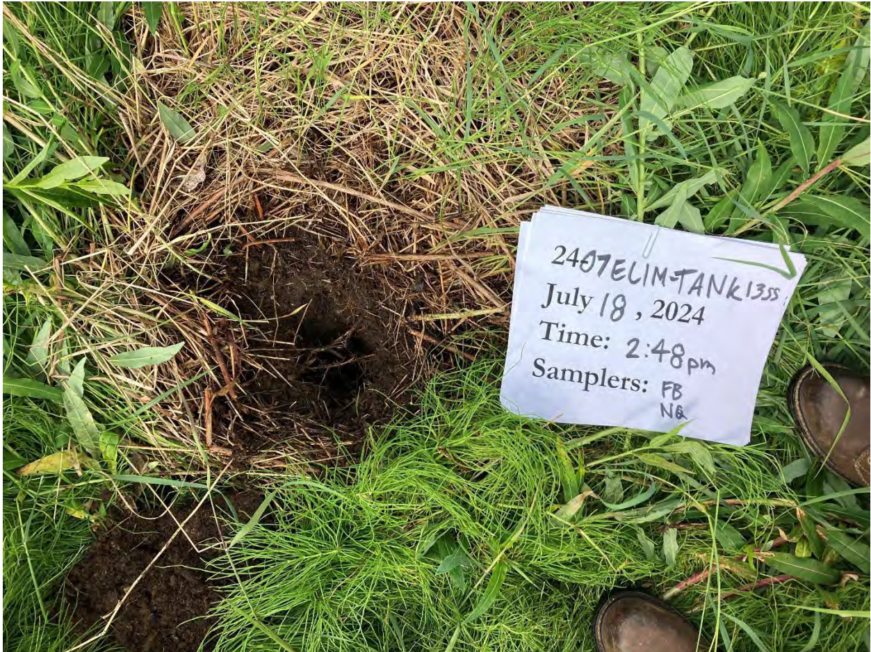
0718ELM26 – 2407ELIM-TANK13SS