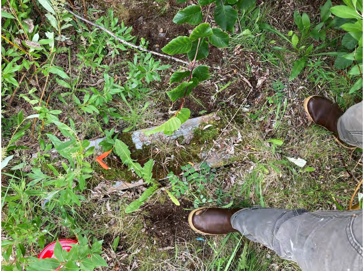
0718ELM28 – Debris by drum area northeast of the tank farm