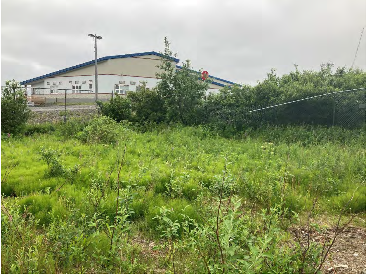
0718ELM01 – Facing south