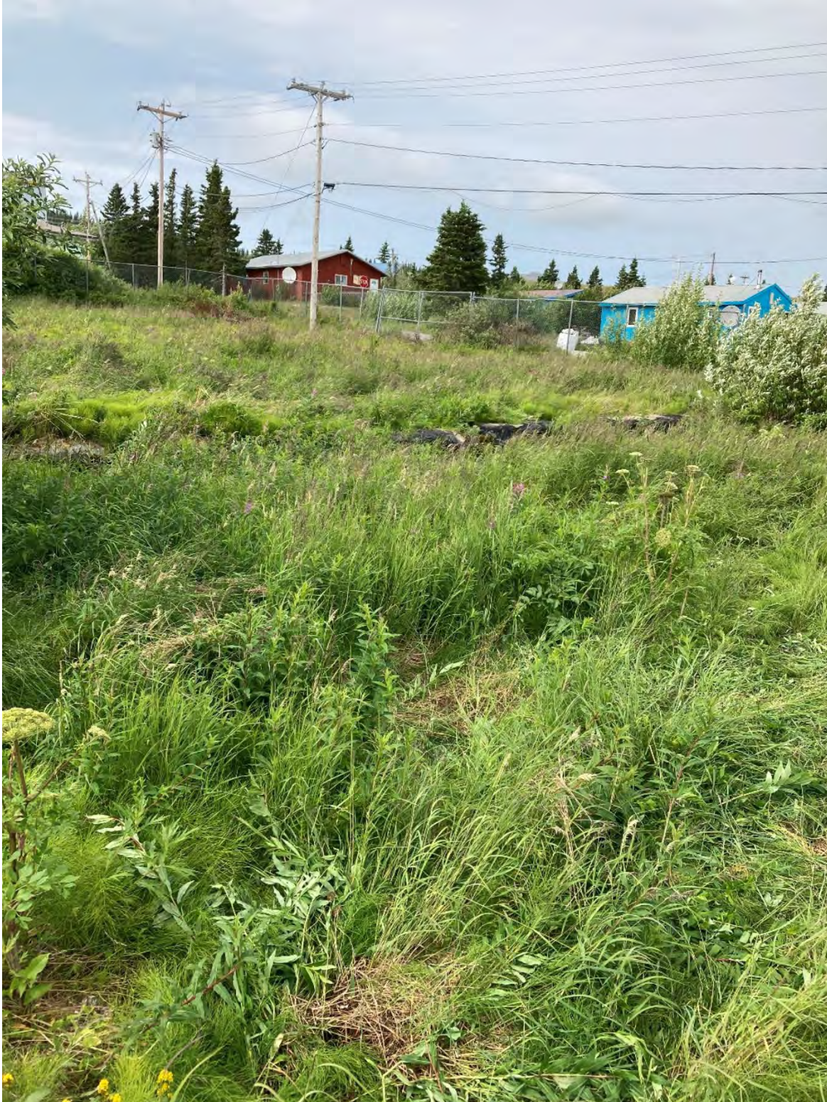
0718ELM36 – View of tank farm facing west from edge of tank farm footprint