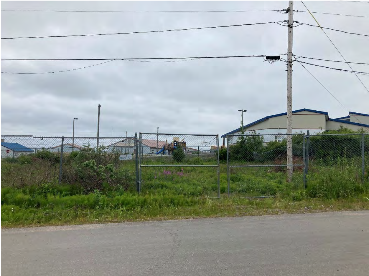
0718ELM14 – View from outside of site, facing southeast