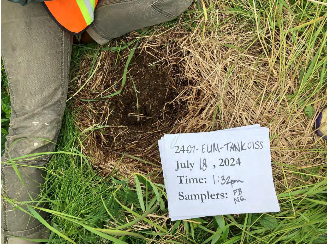
0718ELM18 – 2407ELIM-TANK01SS