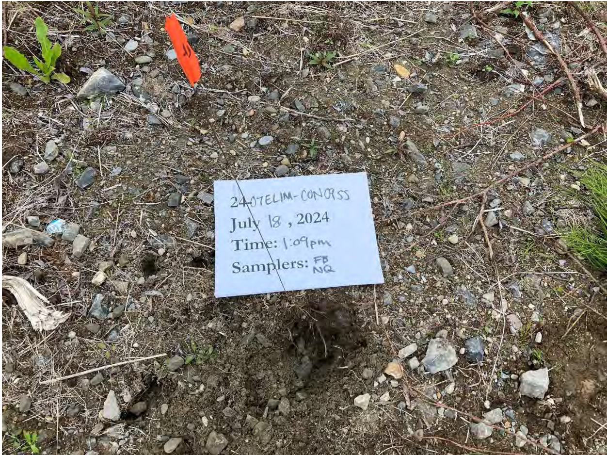
0718ELM16 – 2407ELIM-CON09SS