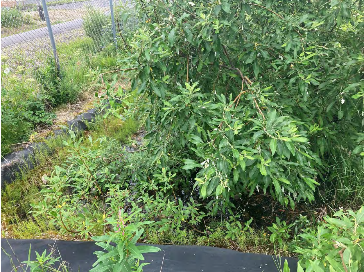
0718ELM09 – Standing water at southwestern edge of tank farm footprint