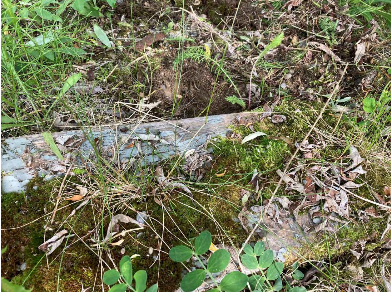
0718ELM33 - Debris by drum area northeast of the tank farm