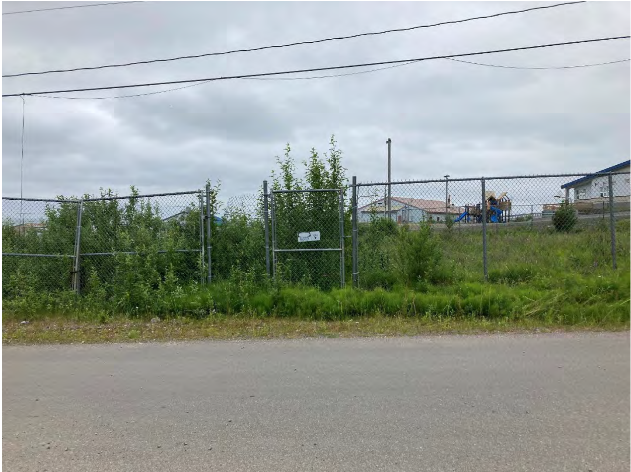
0718ELM13 – View from outside of site, facing southeast