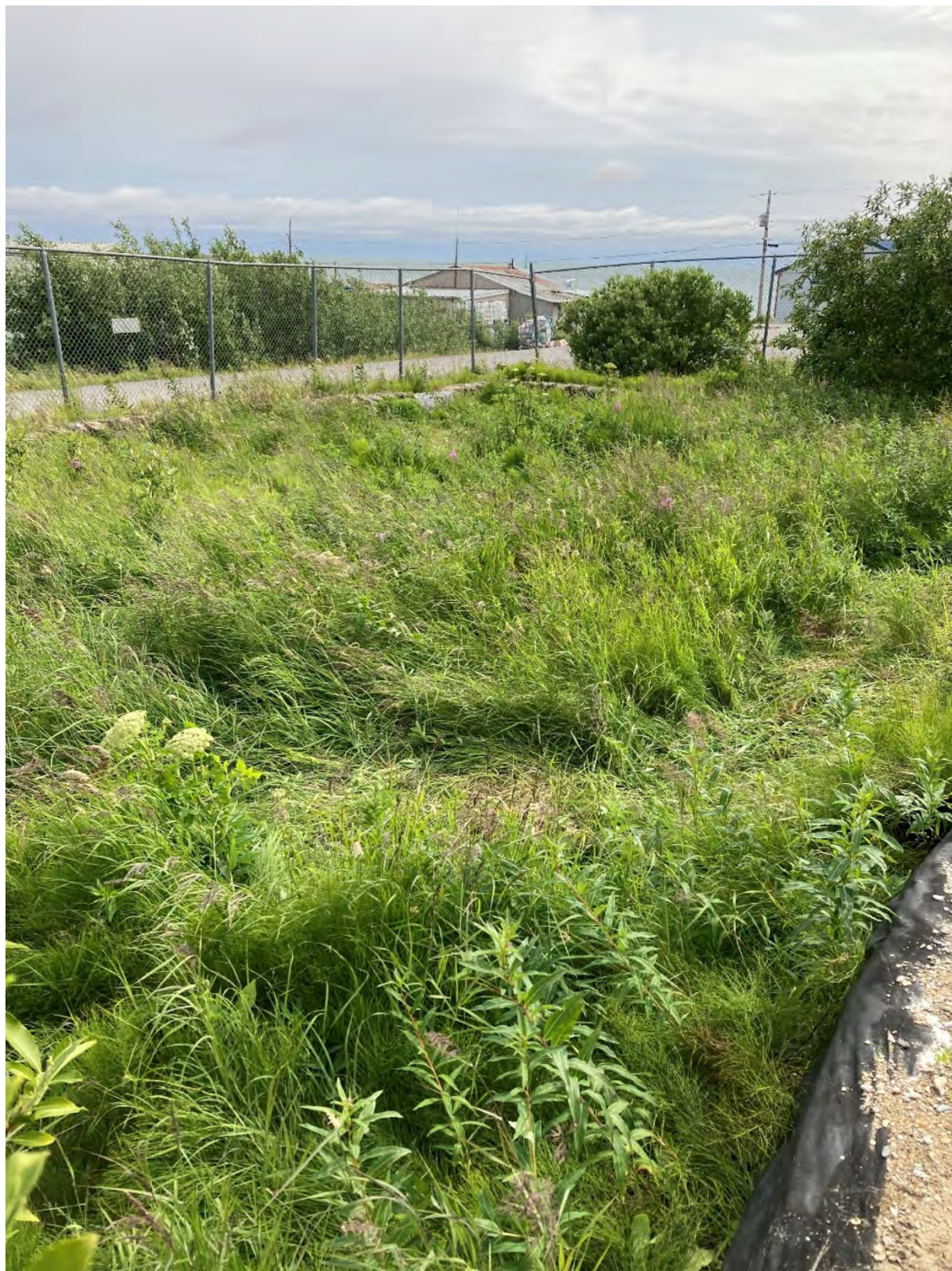
0718ELM35 – View of tank farm facing east