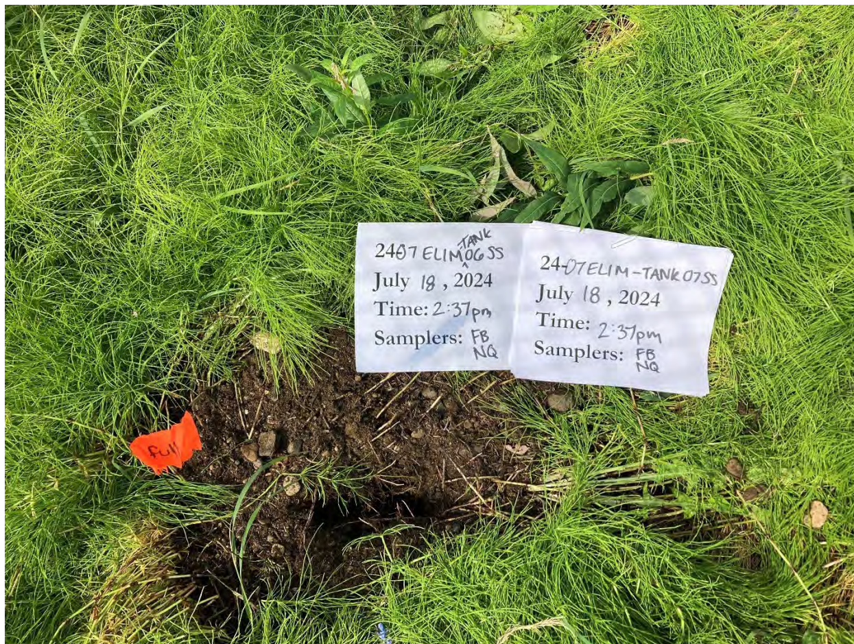
0718ELM25 – 2407ELIM-TANK06SS and 2407ELIM-TANK07SS (duplicate of 2407ELIM-TANK06SS)