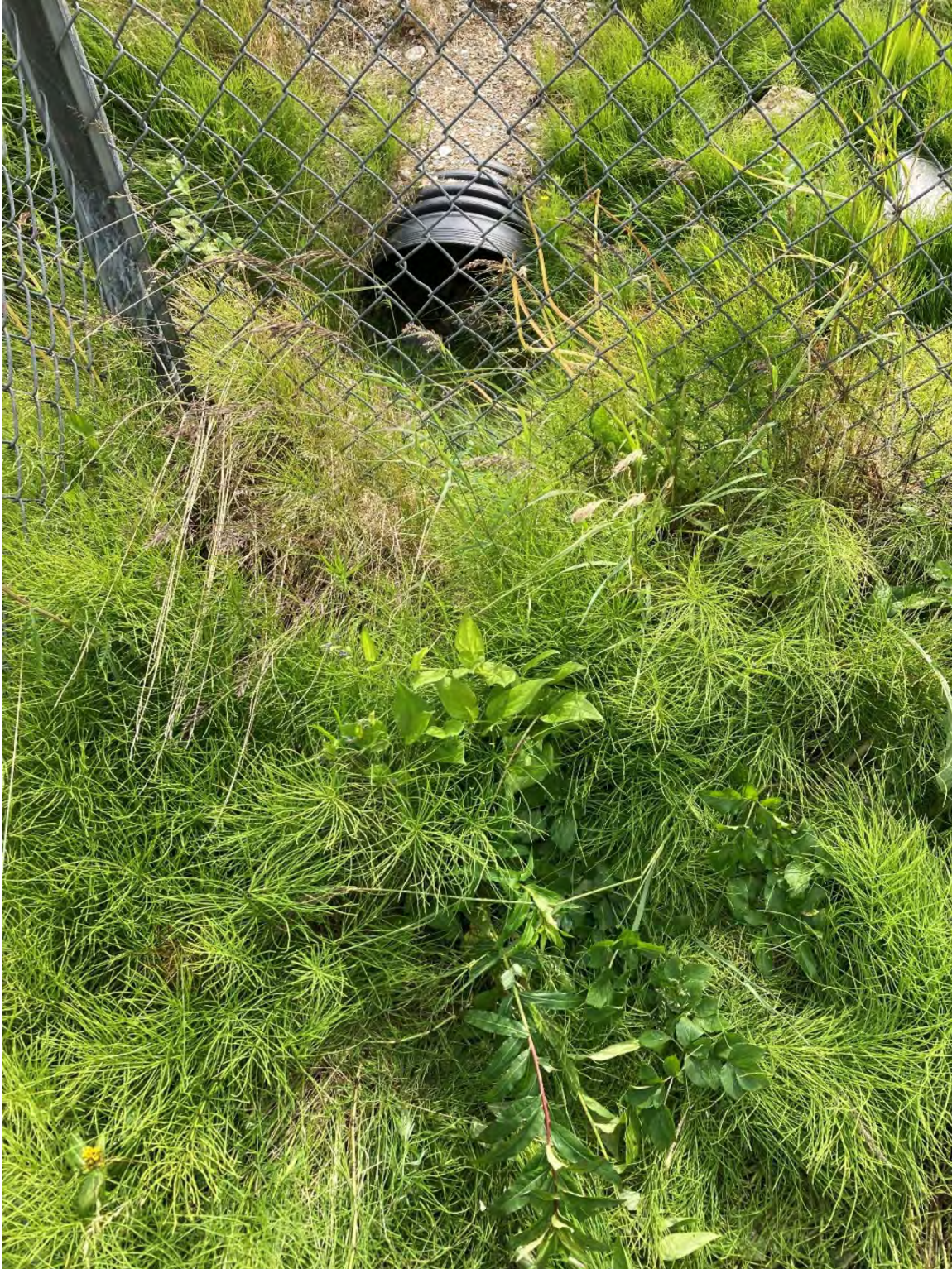
0718ELM38 – Suspected drainage pipe from within site boundaries, facing southeast