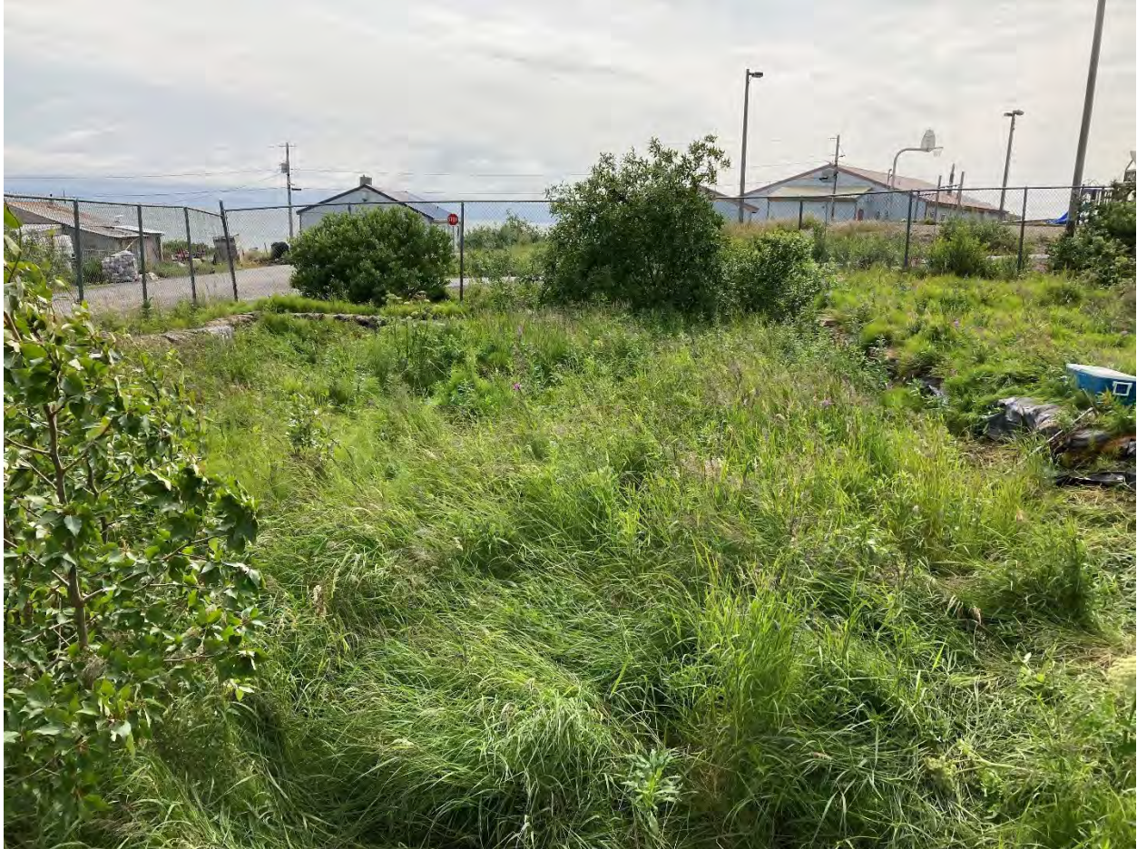
0718ELM30 – Facing southeast, view overlooking tank farm footprint